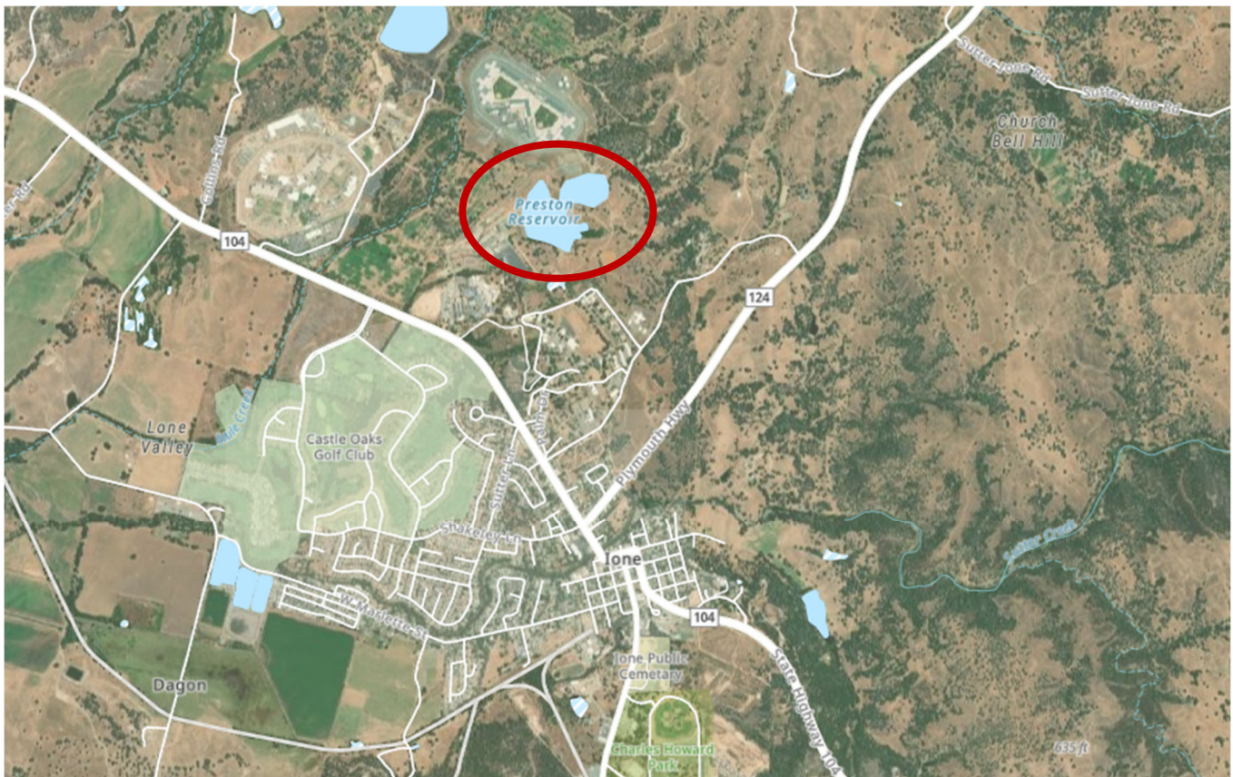
Figure 1- Preston Reservoir/Dam Vicinity Map

In the event of an emergency involving the above reservoir/dam, emergency responders will be able to more efficiently and quickly notify downstream residents of any problems or evacuation notices if they have a cell phone number registered in their system. ARSA encourages you to visit https://www.amadorsheriff.org/administration-division/codered and sign up to receive CodeRED alerts.